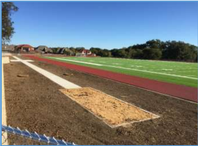
Phase II Turfs, Plano East New Turf, October 2017