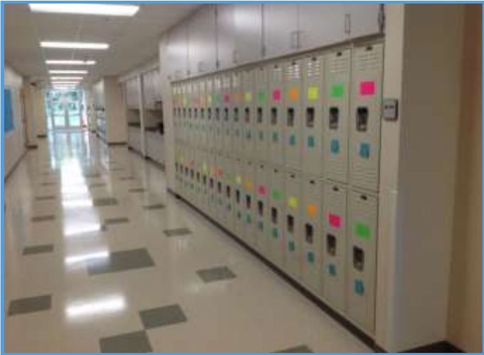
Wells Elementary School, Classroom Addition Hallway, August 2017