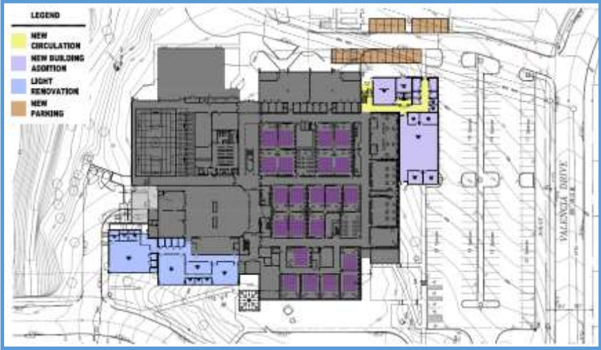
High School Art and Middle School Fine Arts Additions, Schematic Plan – Armstrong MS Fine Arts Addition, May 2018