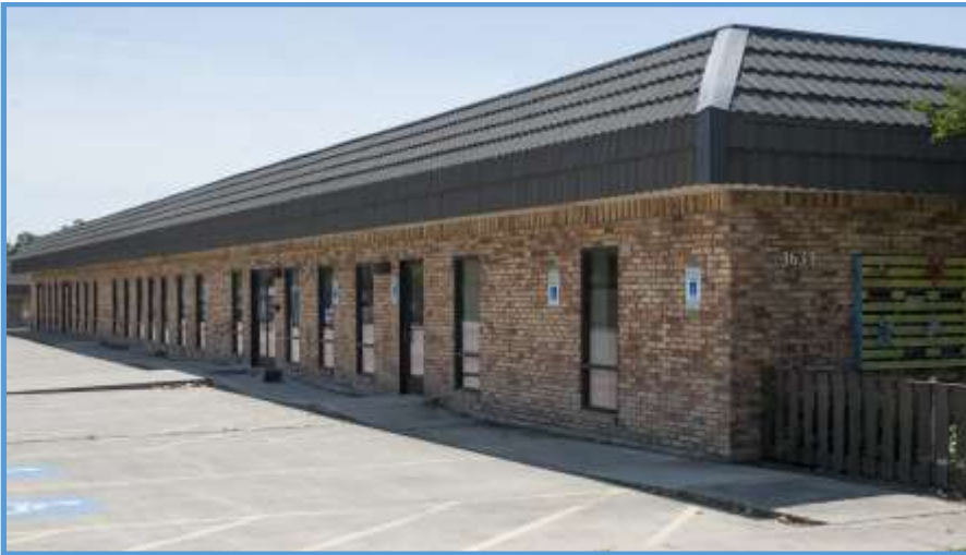
Special Education Adult Transition Center, Main Entry, June 2018