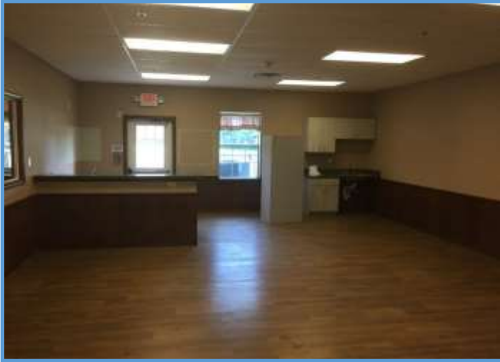
Employee Child Care 3, Interior Rooms under Construction, June 2018