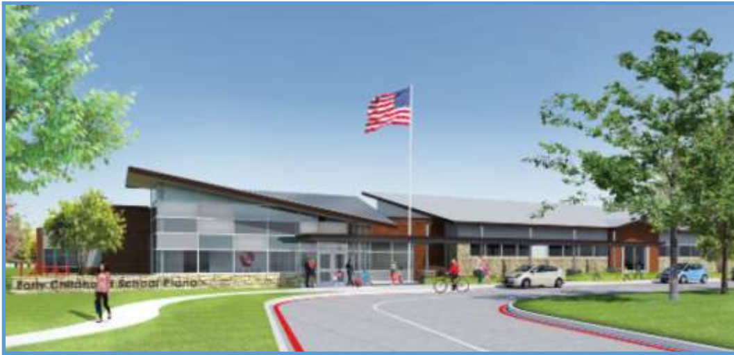
Early Childhood School 4, Main Entry Rendering, June 2018