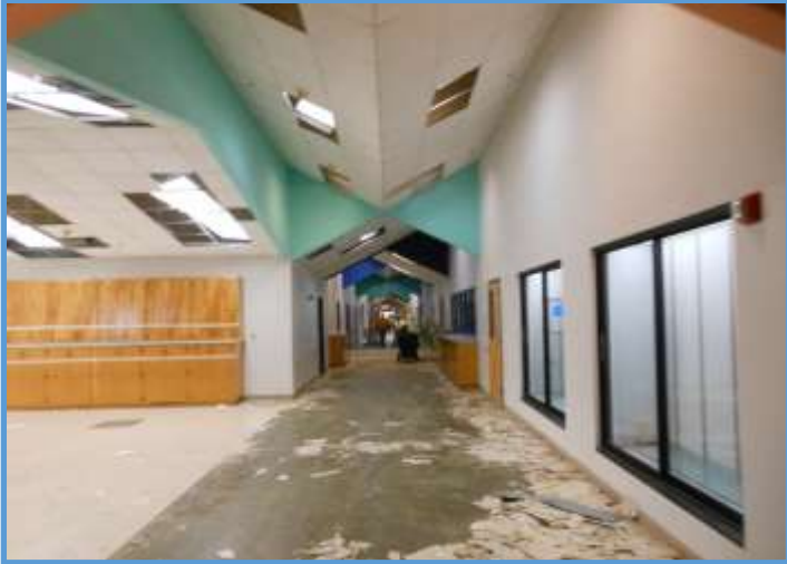
Barksdale Elementary School, Main Hallway Demo, June 2018