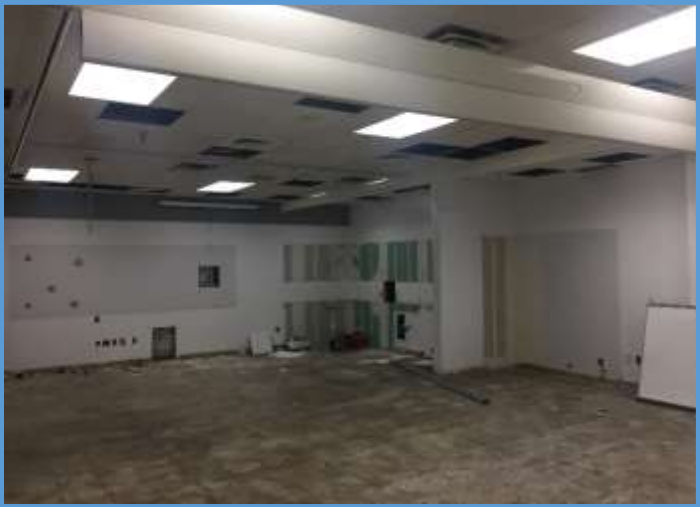
Wilson Middle School, Interior Demo, June 2018