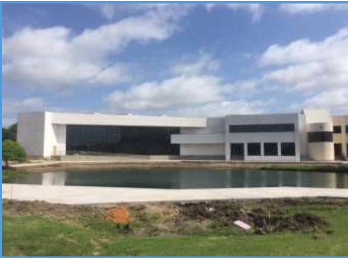
Plano East Senior High School, New Addition Exterior, June 2018