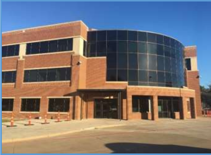
Academy High School Re-Brick, New Brick at West Elevation, October 2017