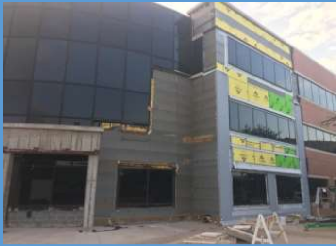
Academy High School Re-Brick, Mock-Up Wall, June 2017