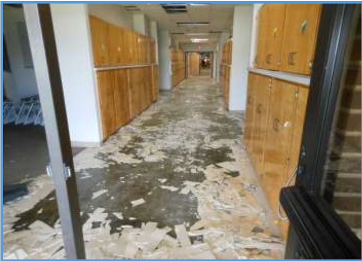
Barksdale Elementary School, Classroom Pod Demo, June 2018