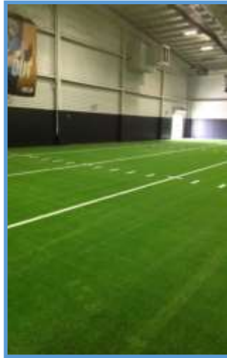
Phase I Turfs, Plano East New Turf Installed, June 2017