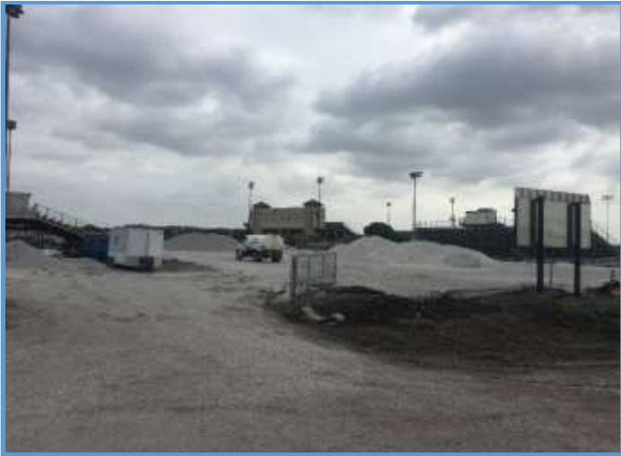
Phase III Turfs, Drainage Gravel, June 2018