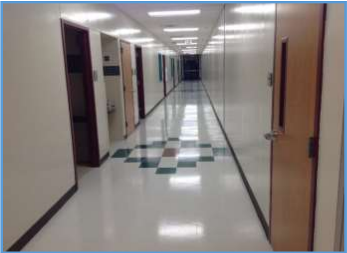
Guinn Special Programs Center, Classroom Addition Hallway, December 2017