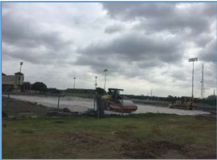
Phase III Turfs, Leveling Fields, June 2018