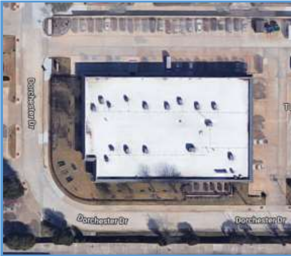
Special Education Adult Transition Center, Site, June 2018