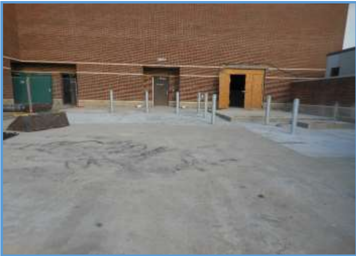
Miller Elementary School, Kitchen Delivery, June 2018