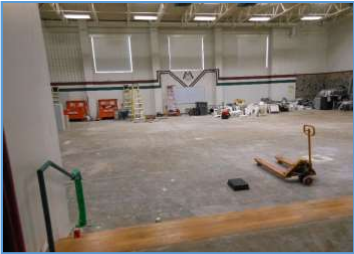
Miller Elementary School, Gym Demo, June, 2018