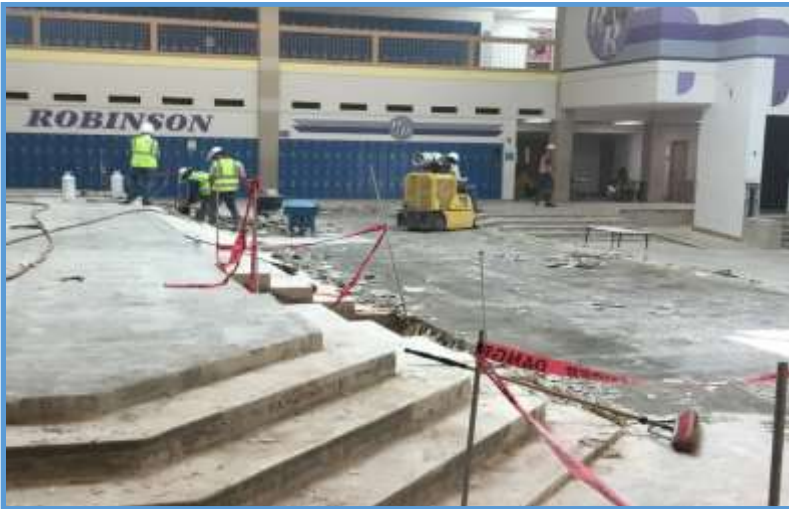
Robinson Middle School, Demo in Dining, June 2018