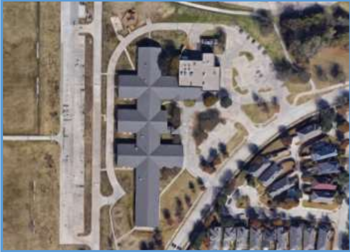
Skaggs Elementary School, Site Plan, June 2018