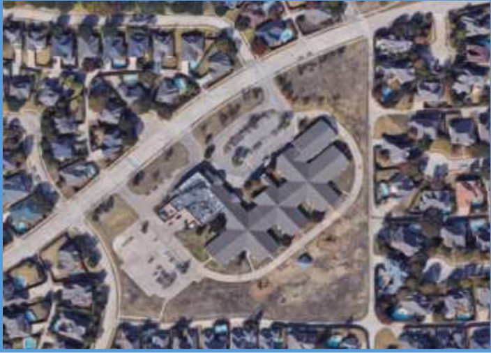
Haun Elementary School, Site Plan, June 2018