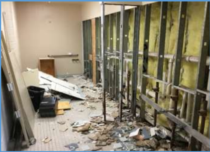
Jasper High School, Restroom Demo, June 2018