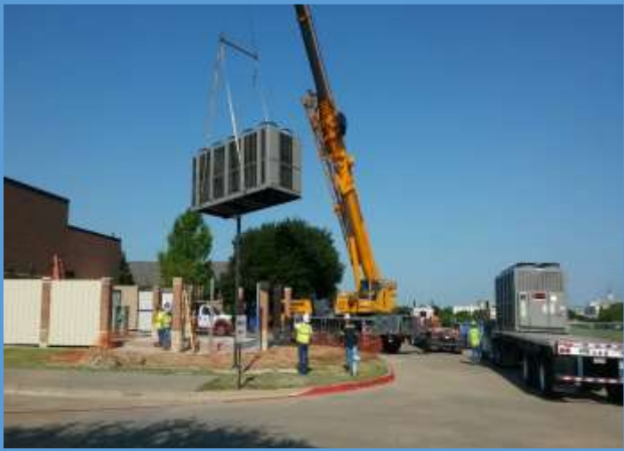
Gulledge Elementary School, New Chillers, June 2018