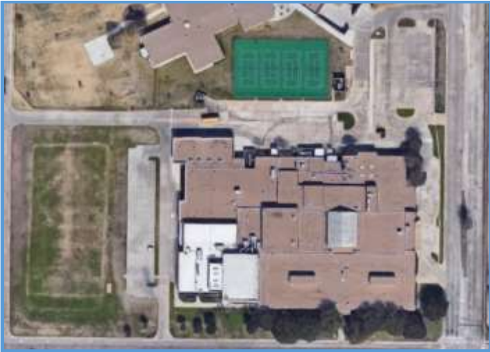
Bowman Middle School, Site Plan, June 2018