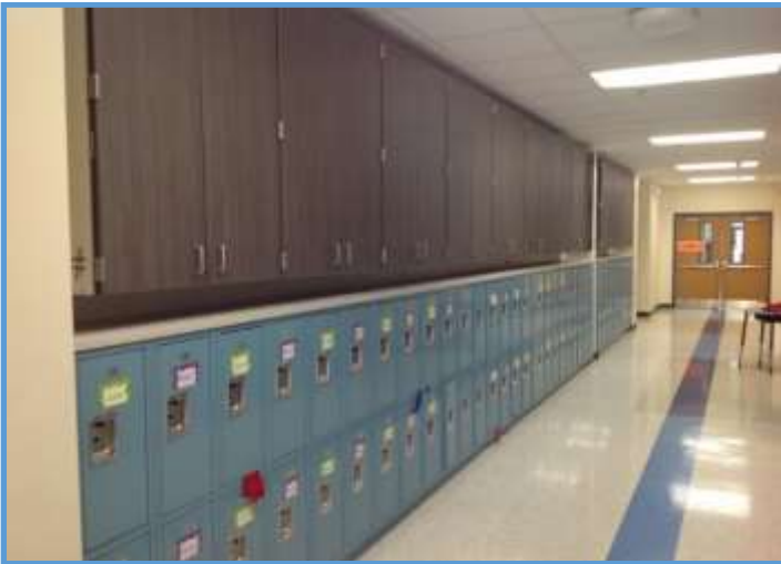
Rose Haggar Elementary School, Refurbished Classroom Pod, October 2017