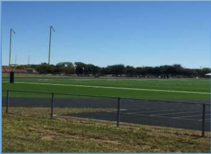
Phase II Turfs, Plano West New Turf, October 2017