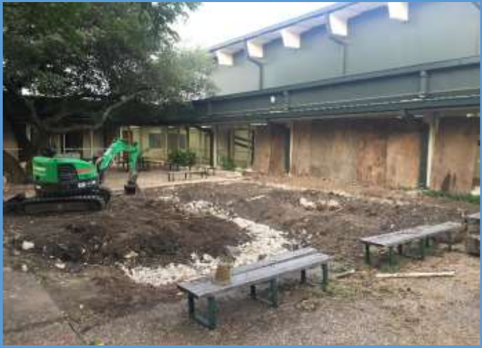
Wilson Middle School, Interior Courtyard Demo, June 2018