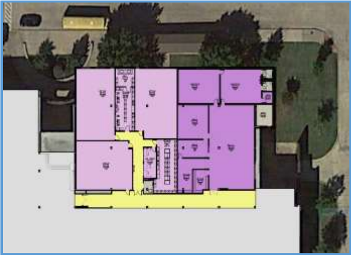
High School Art and Middle School Fine Arts Additions, Concept Plan – Vines HS Art Addition, March 2018