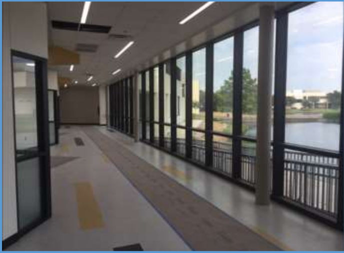
Plano East Senior High School, New Addition Interior, June 2018