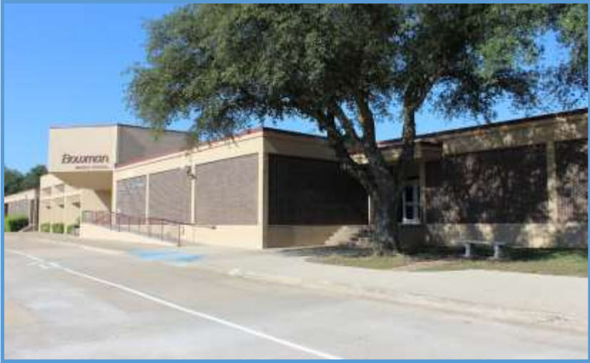
Bowman Middle School, Main Entry, June 2018