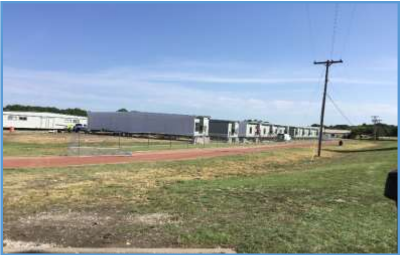
Shepton High School, Demobilization of Portables, June 2018