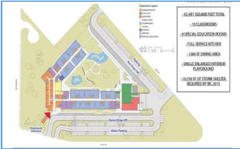
Early Childhood School 4, Overall Floor Plan, June 2018