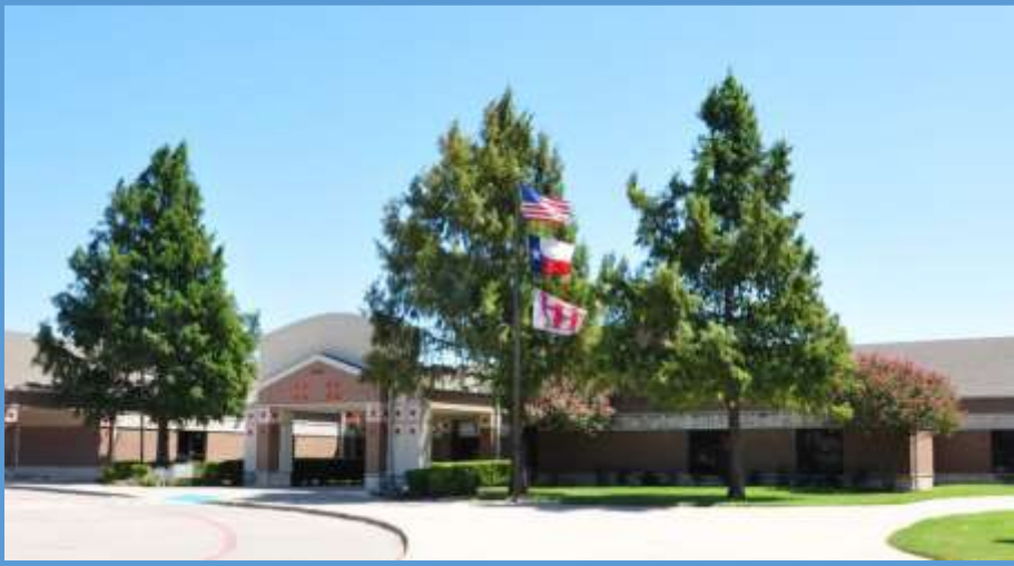
Haun Elementary School, Main Entry, June 2018