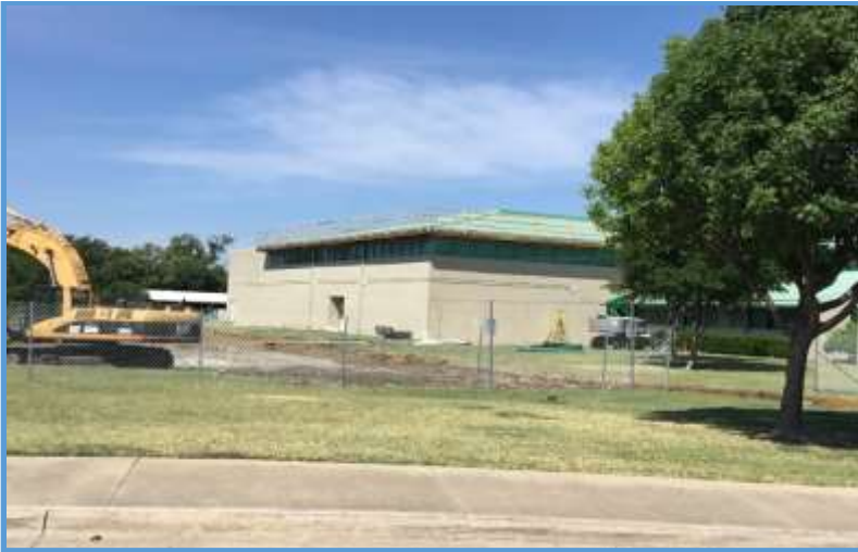
Robinson Middle School, Paving Removal, June 2018