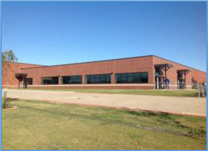
Guinn Special Programs Center, Classroom Addition, August 2017