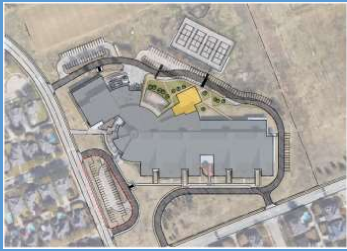
Middle School Fine Arts Additions, Schematic Site Plan, April 2018