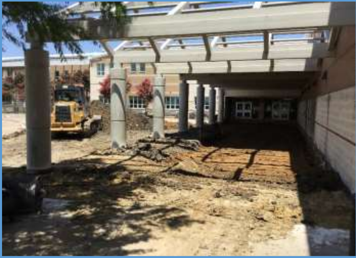
Jasper High School, Back Entry Vestibule Excavation, June 2018