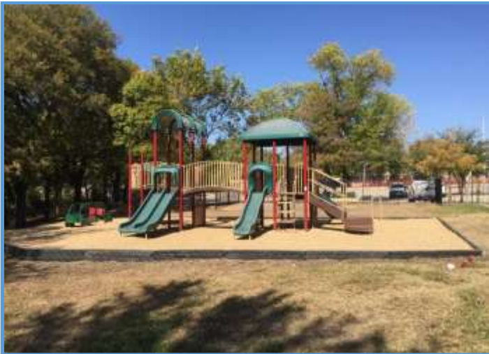
Employee Child Care 3, New Fall Material at Playground, June 2018