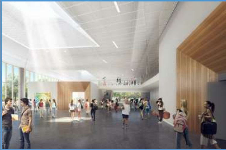
Fine Arts Center, Lobby Rendering, June 2018