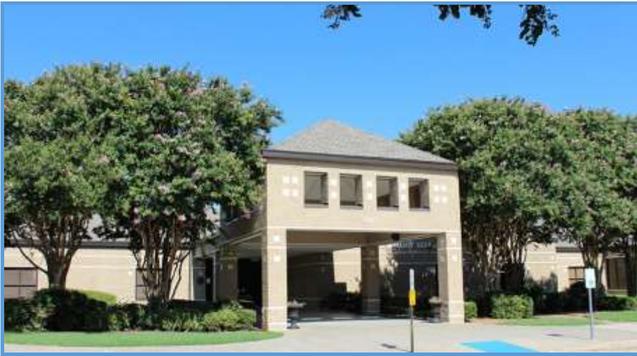
Skaggs Elementary School, Main Entry, June 2018