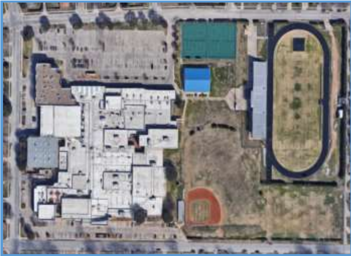
Williams High School, Site Plan, June 2018