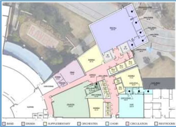
Middle School Fine Arts Additions, Schematic Floor Plan, April 2018