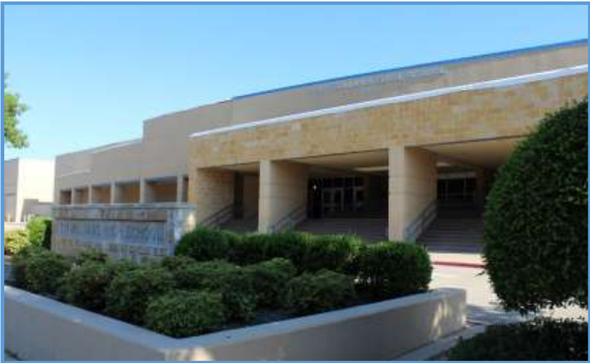
Williams High School, Main Entry, June 2018