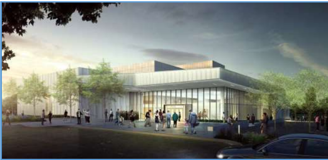
Fine Arts Center, Main Entry Rendering, June 2018