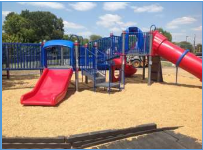
Wells Elementary School, New Playground, August 2017