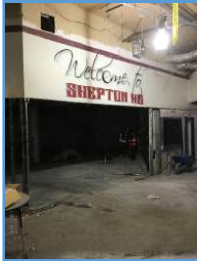
Shepton High School, Existing Library and Admin. Demolition, June 2018